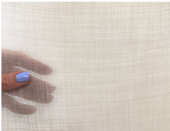
Linen Blend Sheer, Double Width