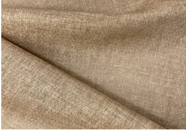
Linen Sheer Fabric