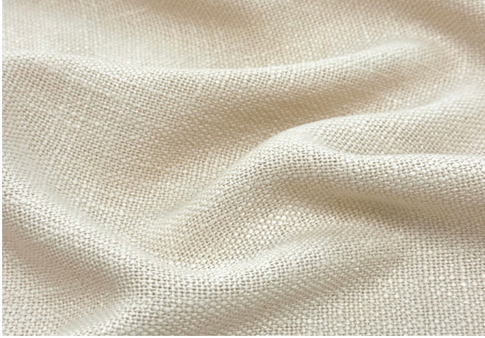
Linen-Look Drapery, Double Width