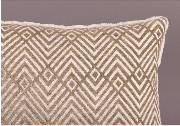
Geometric raffia and chenille