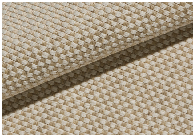
Flame retardant panama